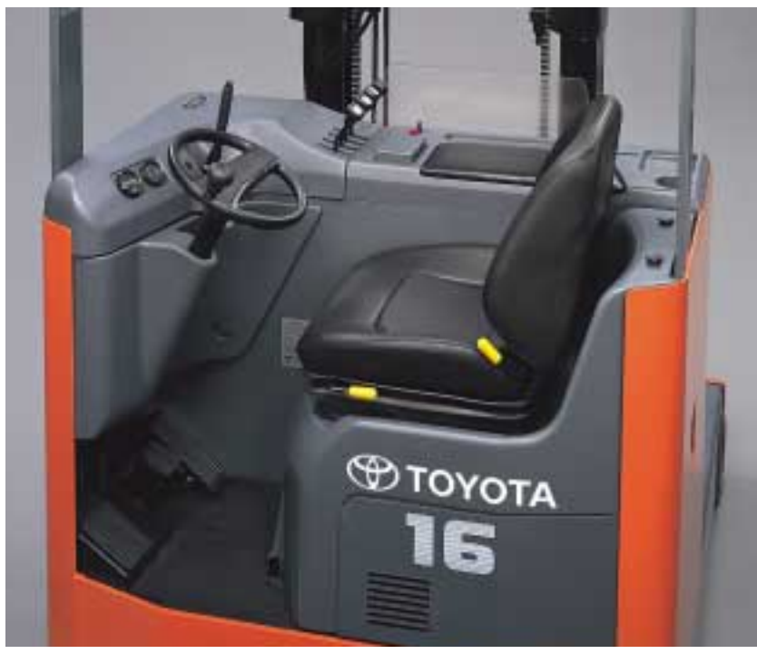
NOTE: The model shown is equipped with the optional 4-way adjustable seat.

Toyota. A name that means reliable comfort for all.